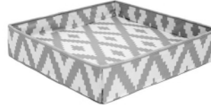
C x 1 (31000)