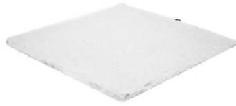
B x 1 (30995)