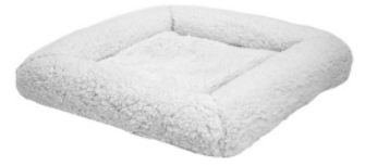
D x 1 (31019)