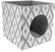
A x 1 (30986)